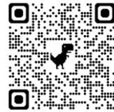
English Version Spanish Version