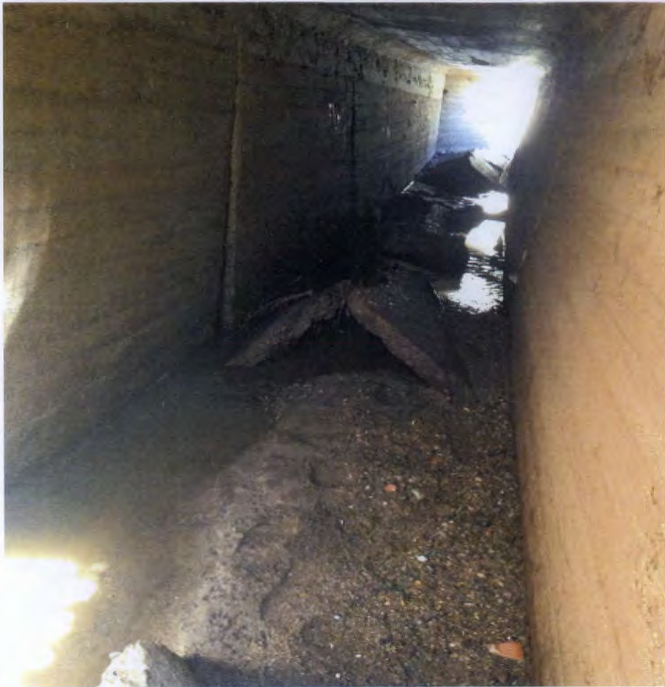
View of box culvert floor buckled looking north