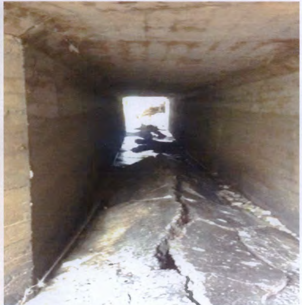
View of box culvert looking south. Water in mid picture is coming from beneath floor of box culvert from upstream.