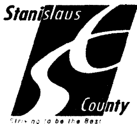
Exhibit C to MSI Appeal

GENERAL SERVICES AGENCY PURCHASING DIVISION