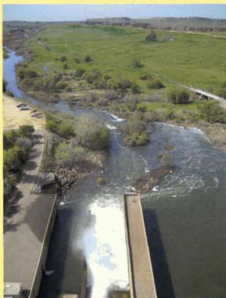
Water from Friant Dam flows into the San Joaquin River

The San Joaquin River Restoration Program (SJRRP) is a comprehensive long-term effort to restore flows to the San Joaquin River from Friant Dam to the confluence of the Merced River and restore a self-sustaining Chinook salmon fishery in the river while reducing or avoiding adverse water supply impacts from restoration flows.